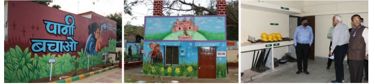
The first two photos are of the beautiful murals in the Children's Garden at staff colony and in the third photo, GM is inspecting the Standard Tool Room cum Rest Room for gangmen at Makapura.

Ahmedabad, The year 2021 began on a great note and we all presumed with vaccines in place and the population getting vaccinated on a large scale very soon, we will go back to normalcy and continue with life as usual. However, all these thoughts vanished overnight, when in March/21 we were hit with the devastating second wave which brought in panic, fear and many of us lost close family members and friends. The mood was somber and stressful. It was all about keeping ourselves safe and finding hospital beds for those who needed them. It was also time for us to give back to society by ways of helping with